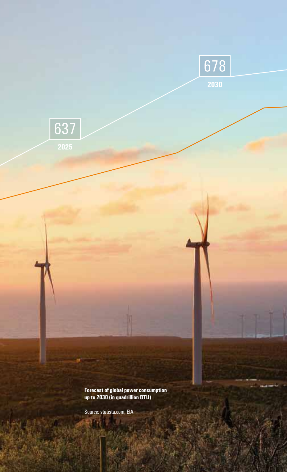
Forecast of global power consumption up to 2030 (in quadrillion BTU)