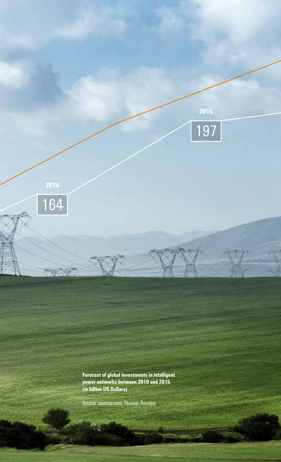
Forecast of global investments in intelligent power networks between 2010 and 2015 (in billion US Dollars)